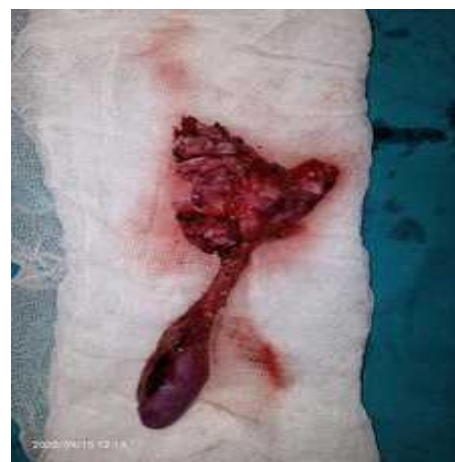
Figure 3: Distal cut end of CBD which appears grossly normal