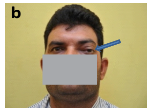
b) : Left eye Myeloid Sarcoma presenting with proptosis