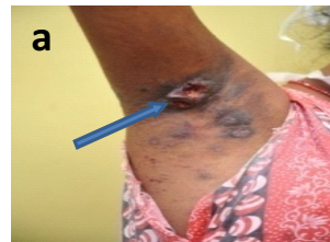
a) : Axillary myeloid sarcoma in female