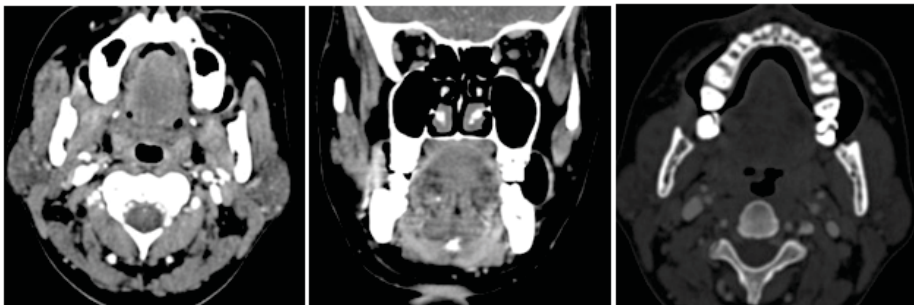
Figure 2 : Stage II malignancy showing mass in retro molar trigone 3cm in size with no nodal involvement or bony erosion.

Stage II tumour shows tumour more than 2cm and less than 3cm with no bone erosion or neck lymphadenopathy (Fig 2)