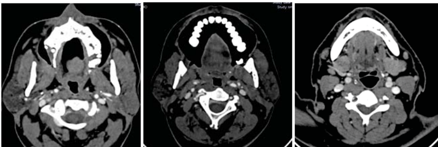
Figure 3 : Patient with stage III malignancy showing en plaque lesion eroding upper bony alveolus without nodal involvement.

Stage III tumor shows upper alveolar mucosa lesion eroding upper bony alveolus without nodal involvement (Fig 3).