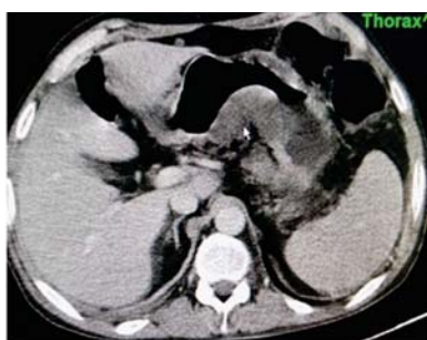
Figure 5: Lesion over lesser curve of stomach