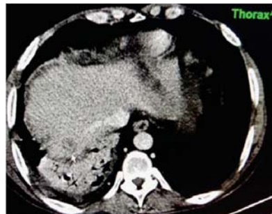
Figure 6: Liver metastasis