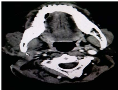
Figure 4: CT image showing lesions over right cheek