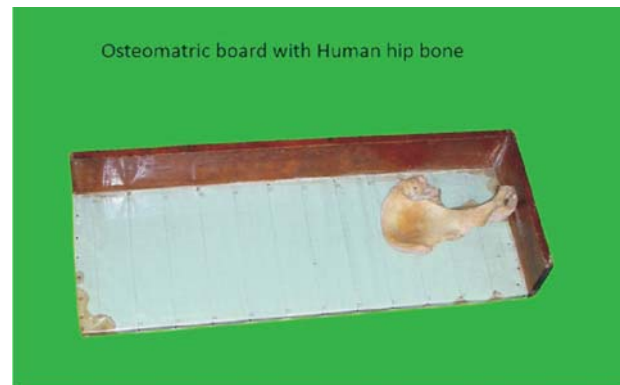
Figure 2: showing bony point on hip bone from where these measurements had been taken.